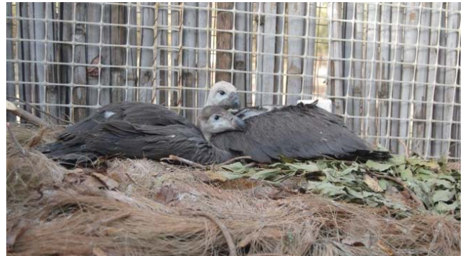
white-backed vulture nestlings

In another part of the globe the breeding season was also going well. Simon had been out to India to the Vulture Breeding Project in November last year to set up the incubators and do some staff training. And over the next few months with much in the way of emails and phone calls, baby vultures started to hatch. Simon went over again in the early spring and the upshot of it all was ten vulture chicks were hatched, three Long-billed Vultures - a World First captive breeding - three Slender-billed Vultures - a world first last year and four Oriental White-backed Vultures. This bodes well for the project in saving the vultures in southeast Asia.