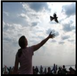
Releasing a banded raptor at Hawk Ridge Bird Observatory

The 2011 Annual Conference will be held in beautiful Duluth, Minnesota on October 5-9, 2011.