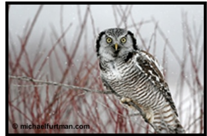
Northern Hawk Owl

Extend your visit to Duluth by a day or two and take advantage of our field trip options. We'll be heading out to birding hotspots along the shoreline of Lake Superior, as well as pre- and post-conference day trips to the restored wetlands of Crex Meadows in Grantsburg, Wisconsin and the legendary Sax-Zim Bog, just north of Duluth.