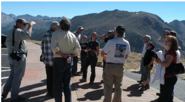
Field trip, Rocky Mountain National Park.