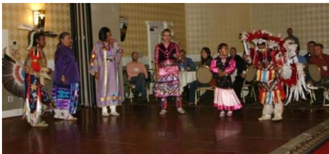
The Iron Family Dancers and singers performing at the Awards Banquet.