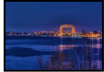
Duluth Aerial Lift Bridge

In the evenings, plan to join us for our opening social (Wednesday), the annual Poster Session and Social (Thursday), a private-chartered scenic excursion and dinner aboard the North Shore Scenic Railway (Friday), and the Saturday Evening Awards Banquet.