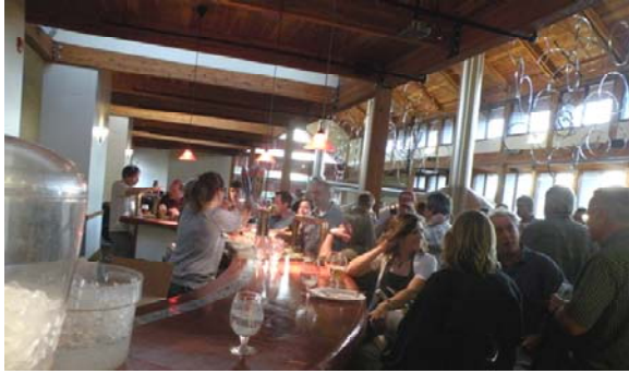
Conference participants enjoying the Friday night social at the New Belgian Brewery.